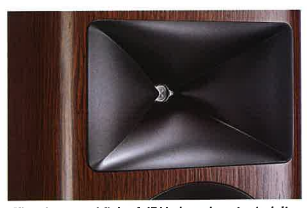
The shape and flair of JBL's horn is patented. It gives wide dispersion, high sensitivity and flat frequency response over a wide band. Plus a projective sound.

The big 3600s sounded smooth and dark in general tonality,