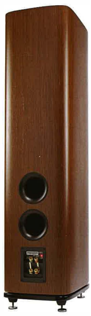
Two large ports provide generous low frequency output, at fairly low distortion, supporting subsonics.

Johannette Zomer's voice soared beautifully in Handel's Lascia chi'io Pianga (DSD64), projected strongly outward at me but without blemish.